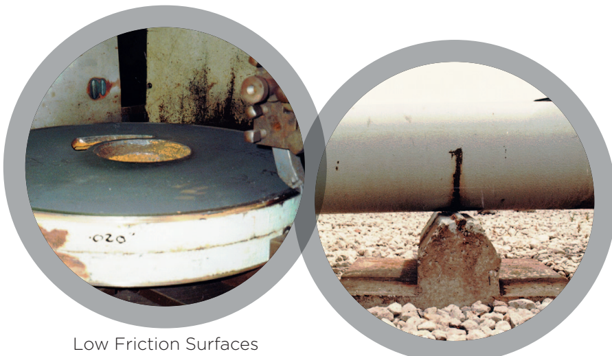
Low Friction Surfaces